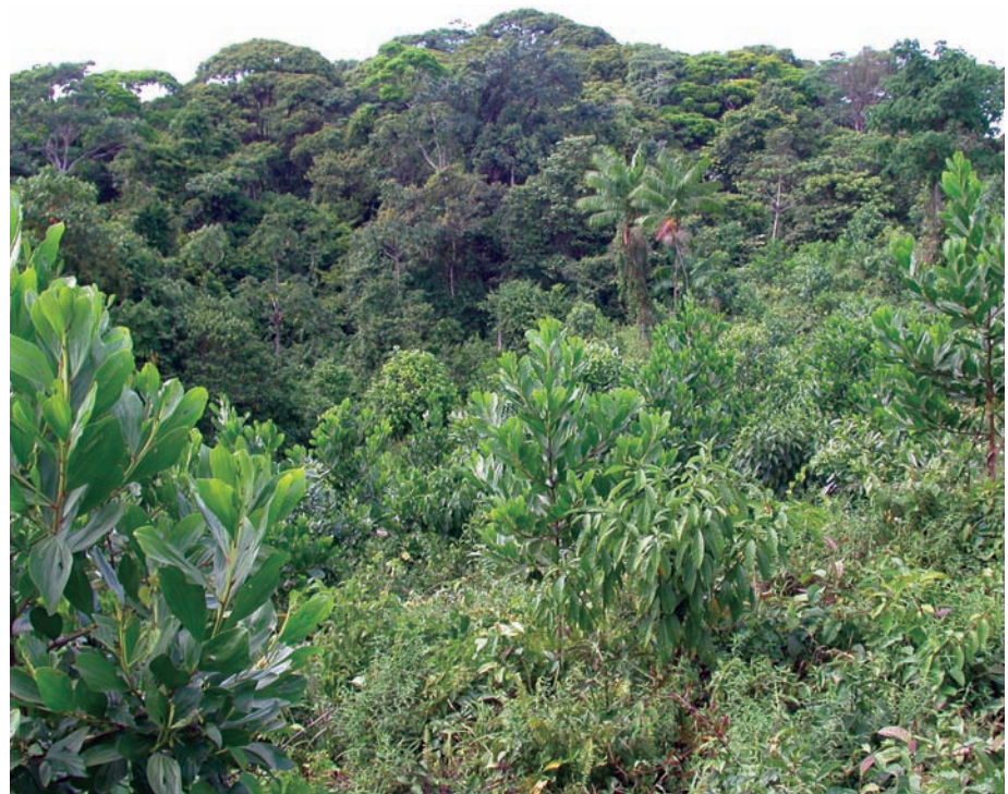
Fig. 2. A commercial restoration plantation in northeastern Costa Rica. In the foreground are planted individuals of Acacia mangium , a fast-growing tree species native to Asia and Australia, which tolerates poor soils. A fast-growing native species, Vochysia guatemalensis is also planted here among the A. mangium trees. In the background is a fragment of 25-year-old secondary forest. Euterpe oleracea , an exotic palm species from Brazil that was cultivated in a nearby plantation has colonized the restoration site (upper right quadrant) and is now invading secondary forests in this area.